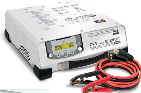
Supplied with cables (5 m - 25 mm 2 )