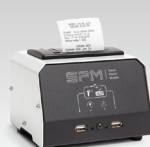
SPM : Smart Printer Module 026919