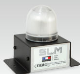
SLM : Smart Light Module 027978