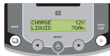
Intuitive interface available in 22 languages