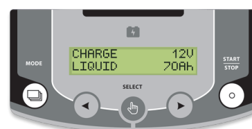
Intuitive interface available in 22 languages