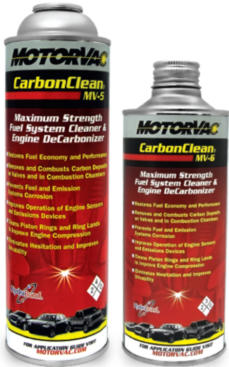
Part No: 400-0050 Part No: 400-0060