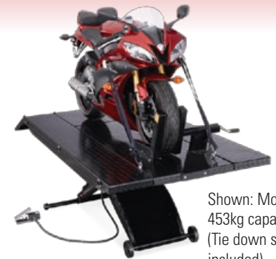
Shown: Model RXLDT 453kg capacity (Tie down straps not included)