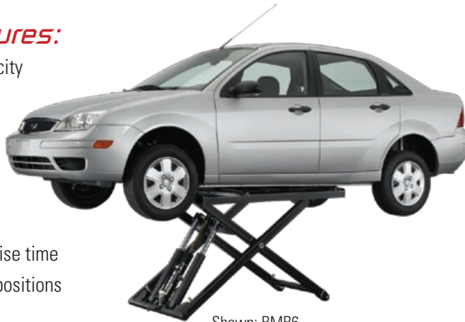
Shown: RMR6 2721kg capacity