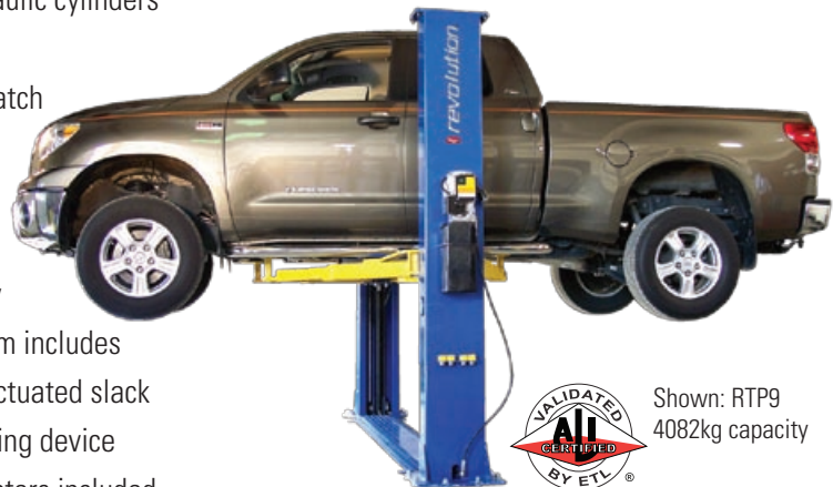
Shown: RTP9 4082kg capacity