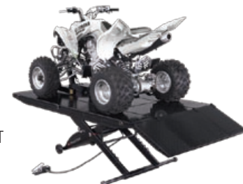
Shown: Model RXLDT with ATV adapters 453kg capacity