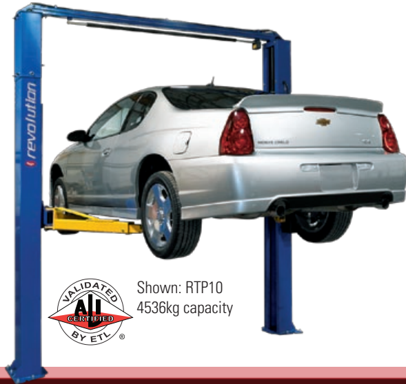
Shown: RTP10 4536kg capacity